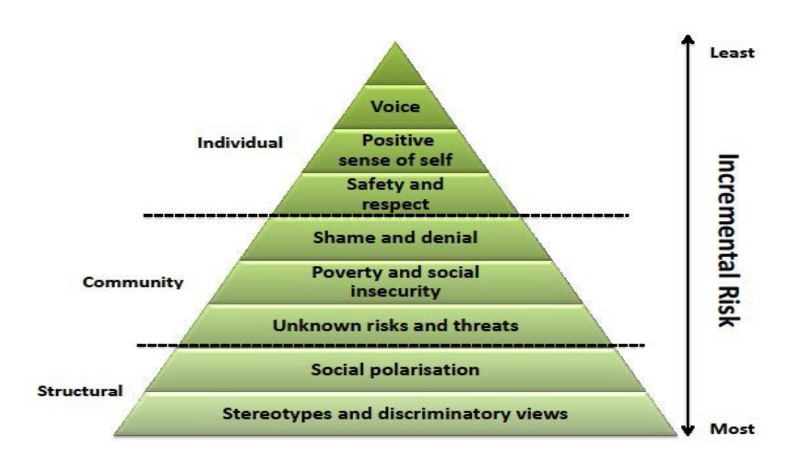
Figure 2 Allen (2015) Incremental scale of added vulnerabilities when assessing risk of CSE.

Understanding the dynamic nature of added vulnerabilities in the assessment of risk should form part of any education plan. In particular, the risk of what is unknown can be difficult to legislate for. However, this can be assisted by maintaining good community relations and reliance on the observations of the public and practitioners of all services. Further areas for prevention are detailed in Figure 2.